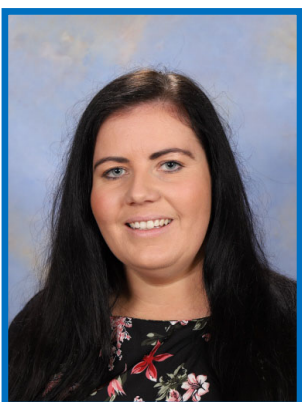
Assistant Principal Curriculum and Instruction