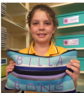
Large Pencil Case