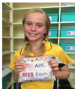
Small Pencil Case