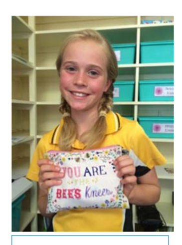
Small pencil case