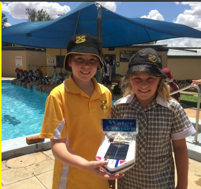
STEM - Solar Boat Challenge

The Newsletter of Ariah Park Central School Week 9B Term 4 Monday, 4 th December 2017