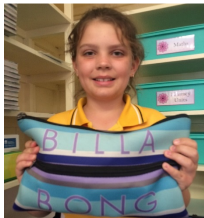
Large pencil case