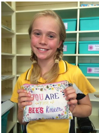
Small pencil case