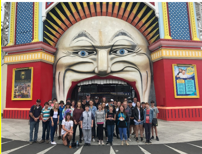
2017 Secondary Excursion - Melbourne