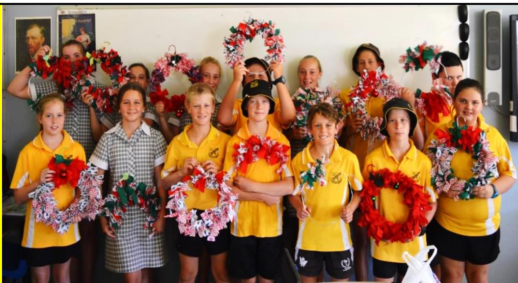
Year 6 Christmas Wreaths