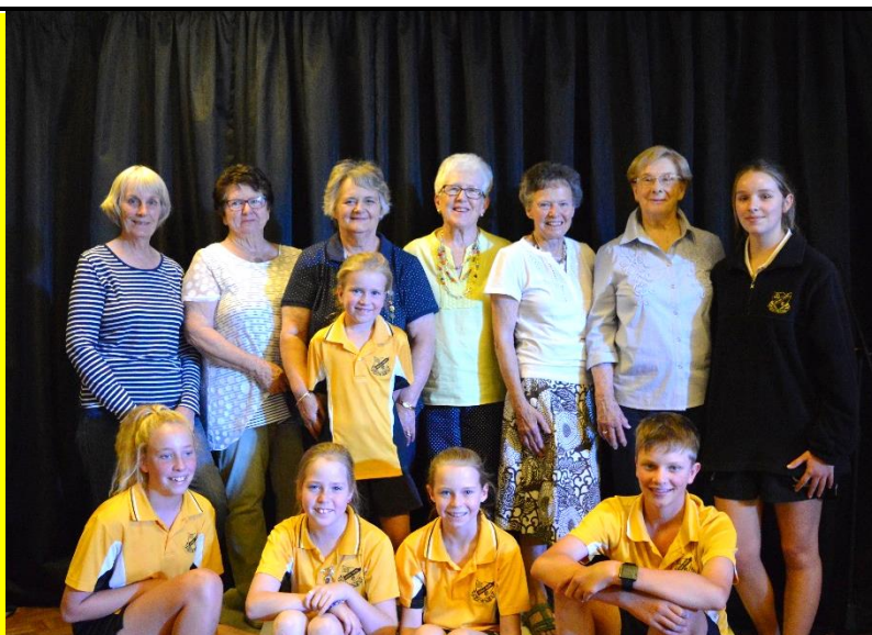
"Girls Shed" members and their grandchildren with the curtains, which were made for the School Hall