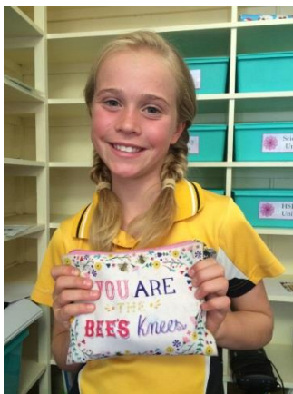
Small pencil case