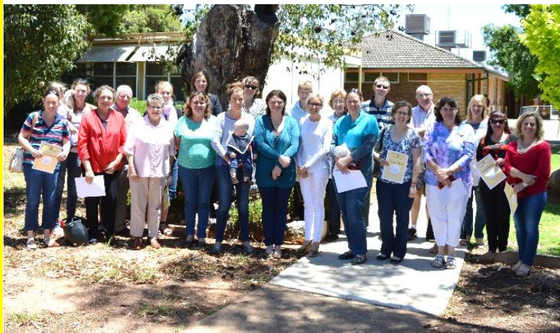
Some of our Volunteers 2016