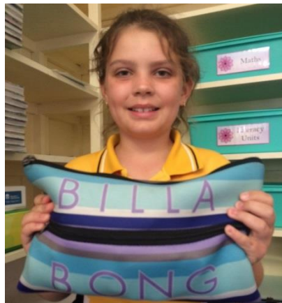
Large pencil case