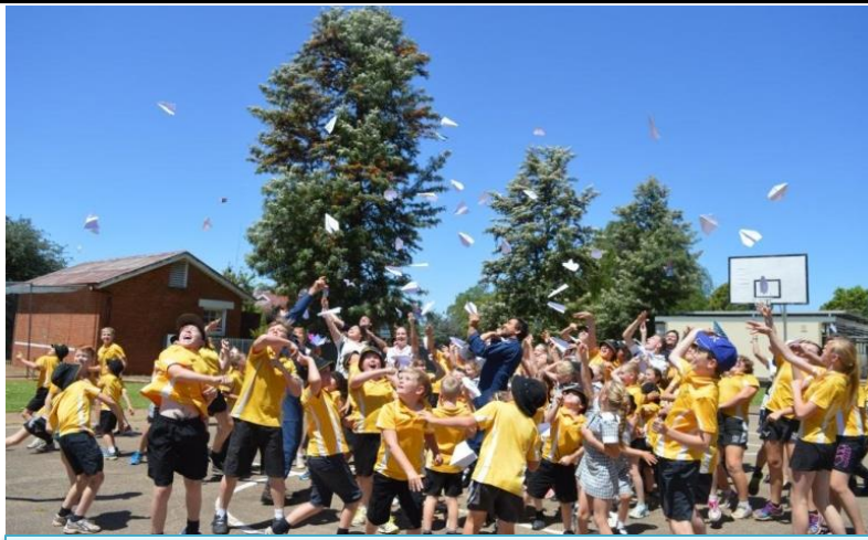
Paper Planes Aloft