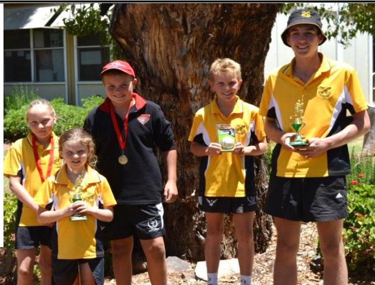
Pairs Cricket Award Recipients 2015