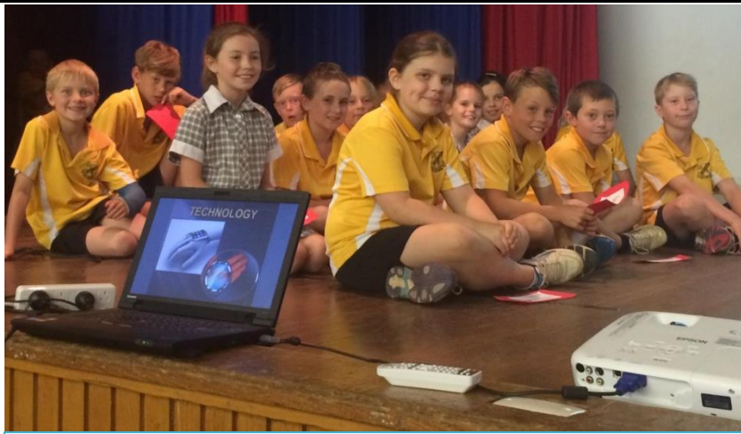
Year 3/4 students at Visions of Temora