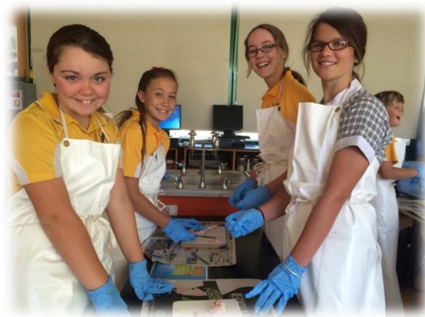
The photos are from year 7/8 science dissecting chicken wings to learn how tendons and muscles work